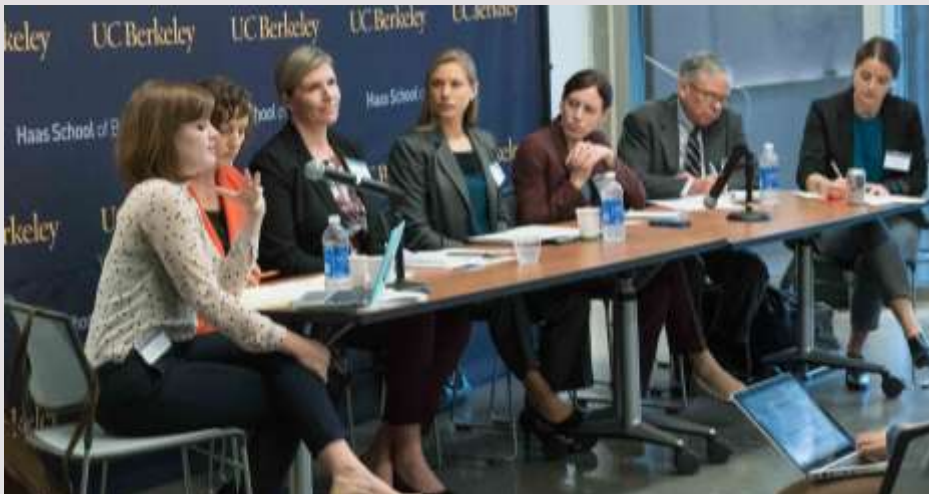
Berkeley Haas CRB, 2015

Throughout 2015, the US Government hosted a series of discussions to help formulate a “National Action Plan” on responsible business conduct. Meetings were held in Berkeley, California; Norman, Oklahoma; and Washington, D.C. NomoGaia attended these sessions to share our field-based insights and help guide concrete, evidence-based approaches for improving transparency and removing bad corporate suppliers from the government supply chain. NomoGaia’s written submission is available here: http://nomogaia.org/2015/05/u-s-national-action-plan-on-responsible-business-conduct-post-iii-of-iii/