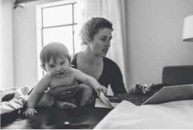
Green Chair Stories, 2015

to amplify our voice and advance our work helping companies respect rights.