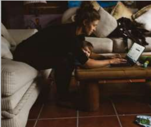
Green Chair Stories, 2016